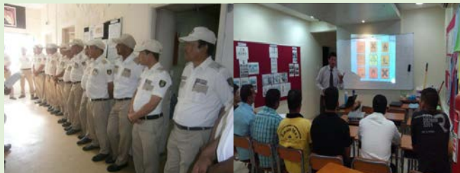
I PEST CONTROL